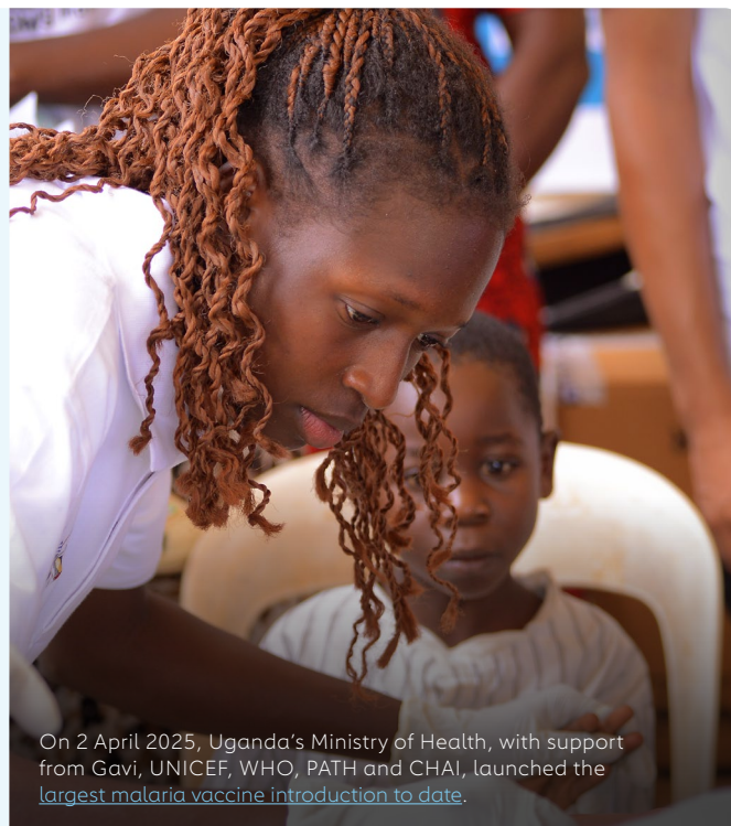
On 2 April 2025, Uganda's Ministry of Health, with support from Gavi, UNICEF, WHO, PATH and CHAI, launched the largest malaria vaccine introduction to date .

On 25 April (World Malaria Day), Mali launched the first age-based and seasonal hybrid approach – providing the first three doses monthly throughout the year, dependent on age, followed by fourth and fifth doses just before the start of the high transmission season.