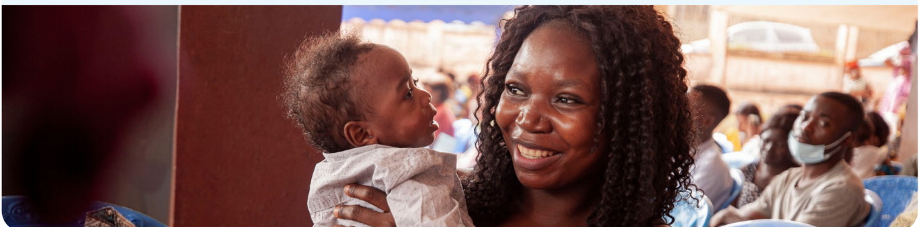
Malaria vaccination. SOA District Hospital, Cameroon.

Members of the public were invited to engage in dialogue at community meetings that included traditional and religious leaders. These successful community engagement efforts have led to high levels of public acceptance of the vaccine and growing demand from parents.